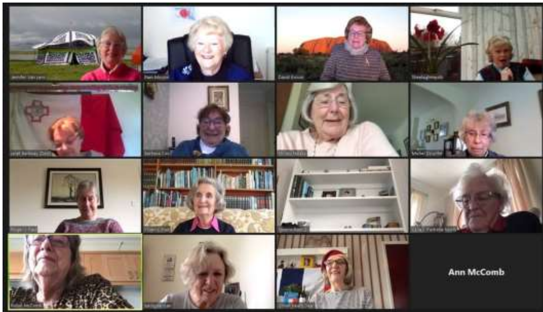
International IW Day Quiz